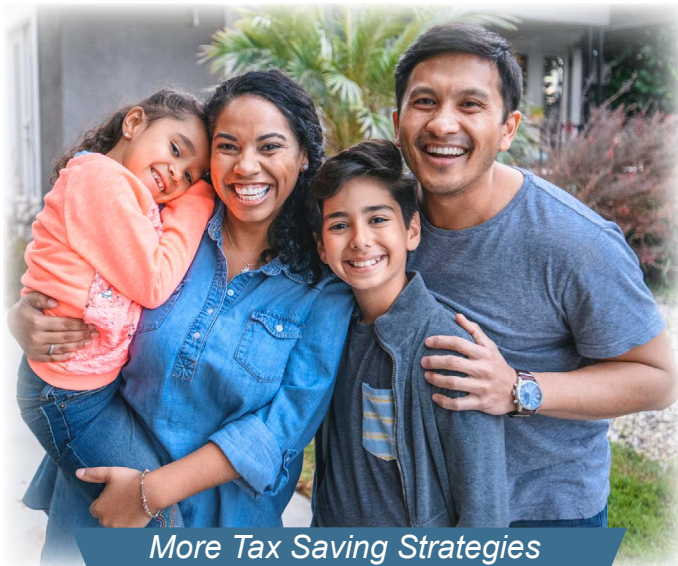
More Tax Saving Strategies

Be sure to contact us before the end of the year if you have questions about your situation. We can help you determine if accelerating or deferring your income can provide tax benefits.